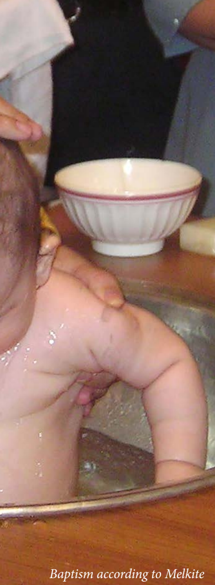
Greek Catholic Church.